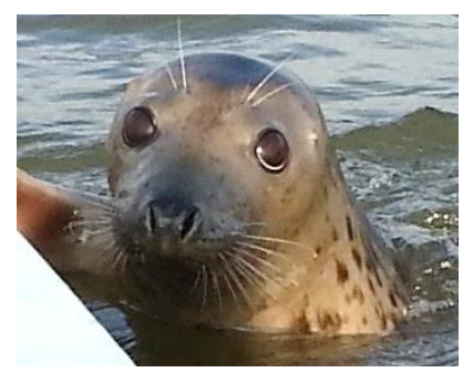
Juveniles are often much lighter in colour and plainer / less patterned

Please report seal sightings to: kimmeridge@dorsetwildlifetrust.org.uk or call 01929 481044