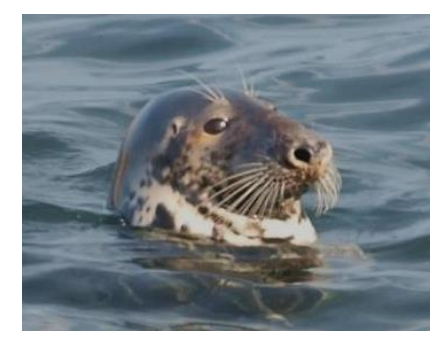
Adult females are usually lighter in colour with dark markings