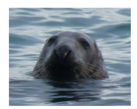
Adult males tend to be much darker with fewer but lighter markings