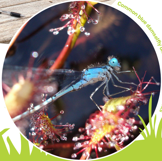
Common blue damselfly on sunbaw

Any comments or queries on the contents of this handbook should be directed to the volunteering team on 01202 692033 or email to volunteering@dorsetwildlifetrust.org.uk .