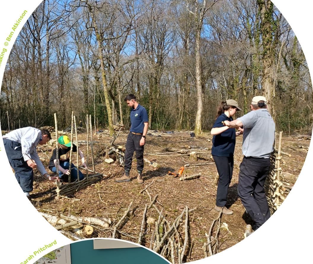
Office volunteer