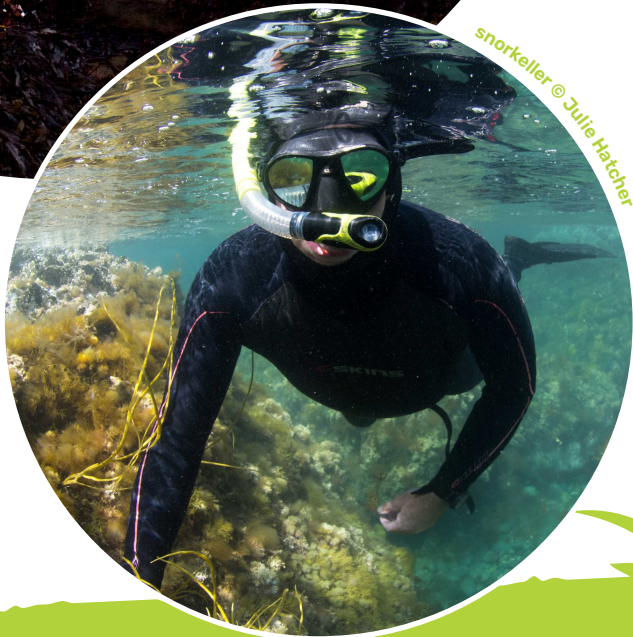
snorkeller

Any suggestions or comments on volunteering or on this handbook are most welcome by phone to 01202 692033 or email volunteering@dorsetwildlifetrust.org.uk .