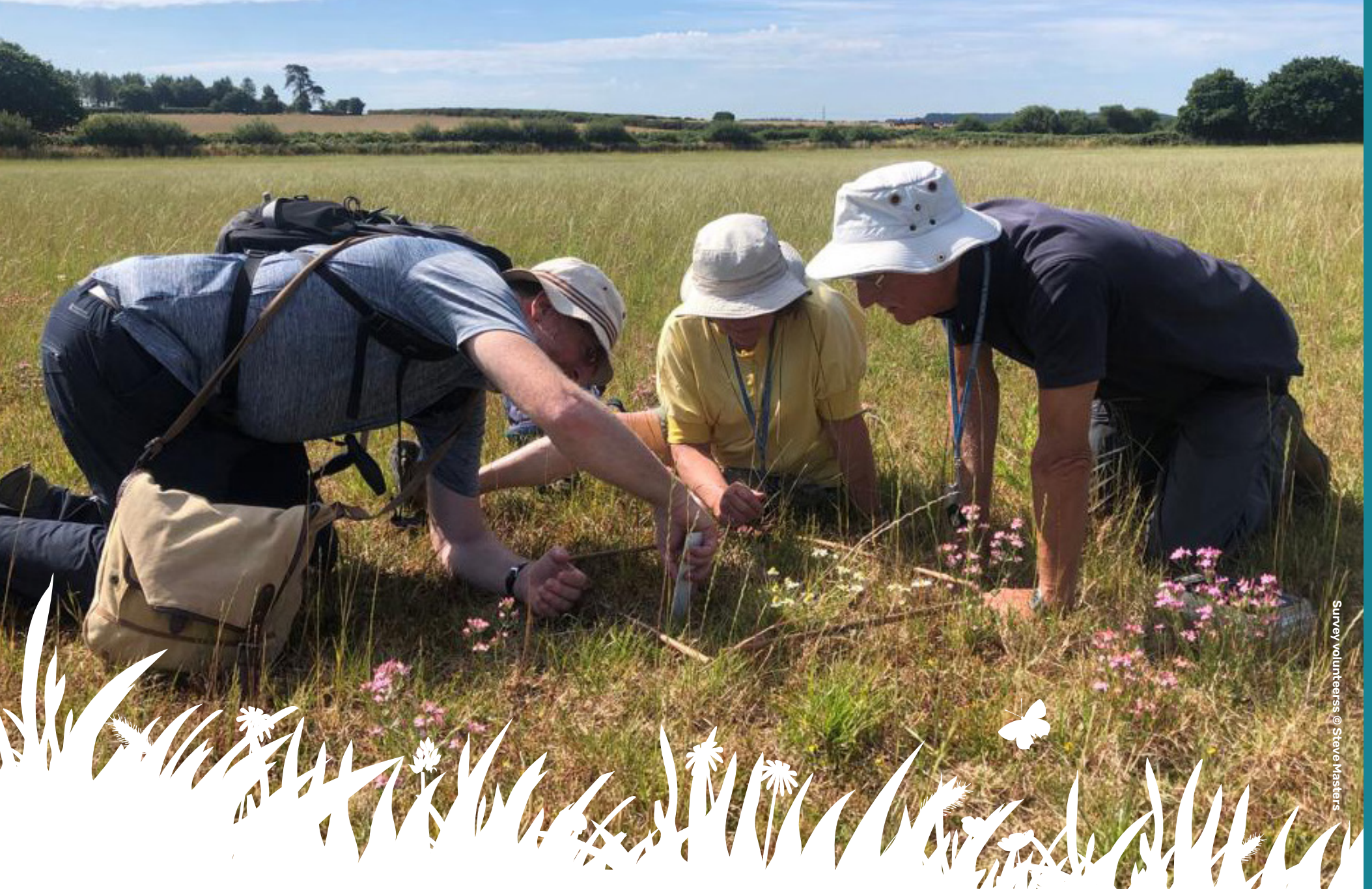
Survey volunteers