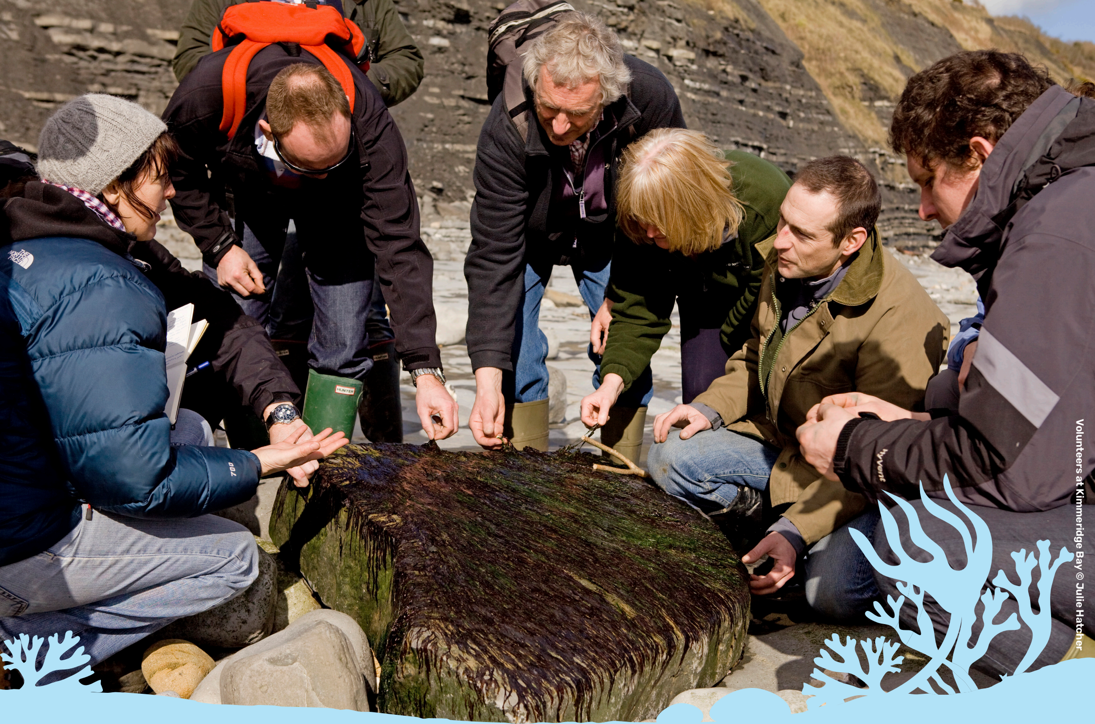
Volunteers at Kimmeridge Bay