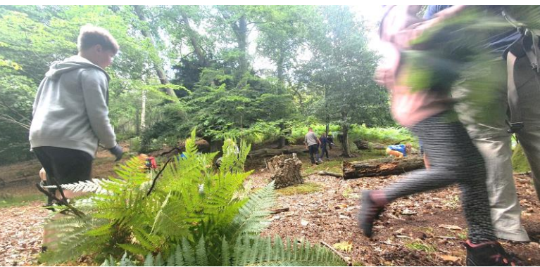
Left: Youth Volunteers getting speedy with the bracken clearance!