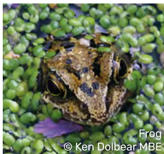
Frog © Ken Dolbear MBE