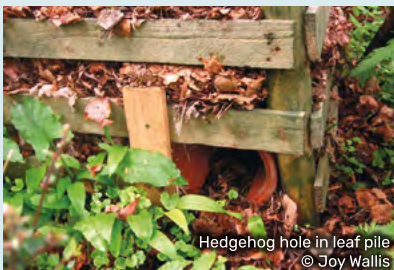
Hedgehog hole in leaf pile