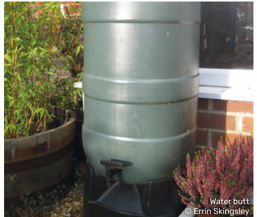
Water butt

Provide sources of clean drinking water and bathing water. This is especially important in the winter when most other water sources will be frozen - birds need to drink every day, just like us.