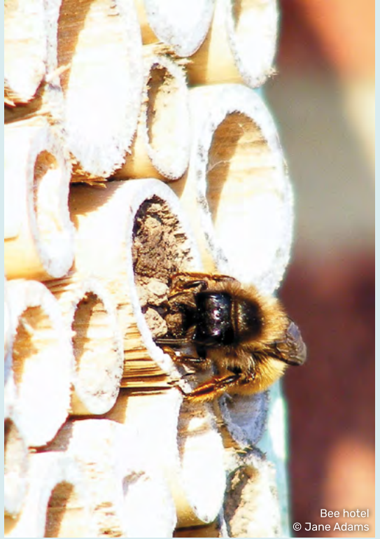
Bee hotel © Jane Adams

Think you don't have enough space for plants? Think again! This leaflet offers tips on attracting wildlife to balconies, patios and window boxes. Most wildlife is remarkably mobile - provide the right conditions and it will find you.