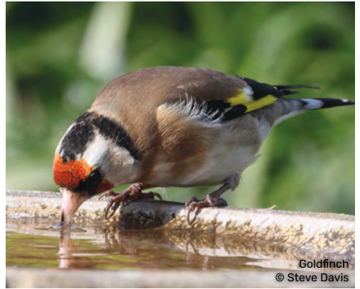
Goldfinch