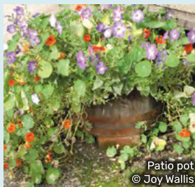
Patio pot