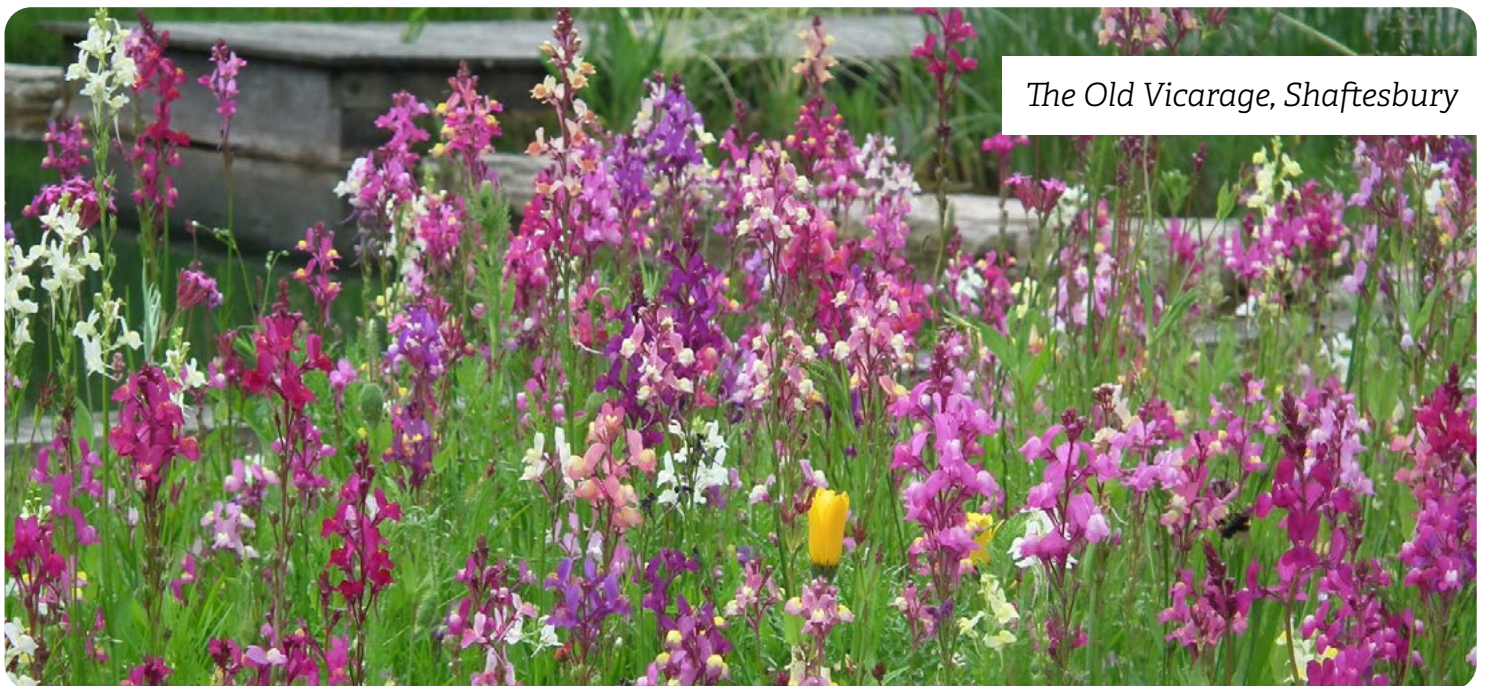
The Old Vicarage, Shaftesbury