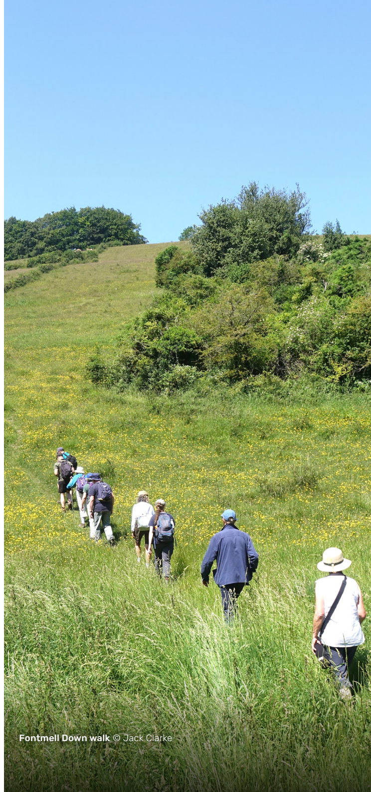
Fontmell Down walk