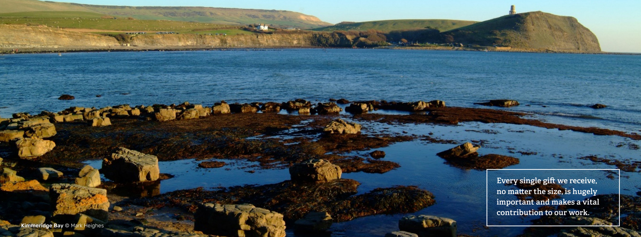
Kimmeridge Bay

Every single gift we receive, no matter the size, is hugely important and makes a vital contribution to our work.