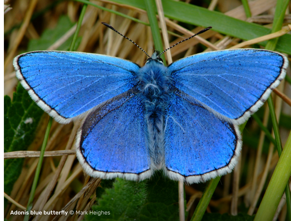
Adonis blue butterfly

We need nature, and it needs us. Gifts in wills allow us to protect more nature reserves, save more species, and ensure that future generations can experience the wonder of nature, just like we do.