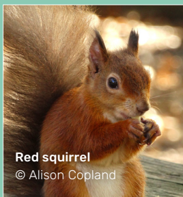
Red squirrel

Over the last five years, 12% of our overall funding has come from gifts in wills.