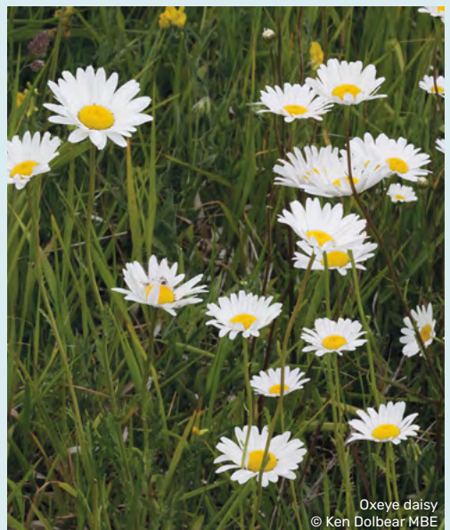
Oxeye daisy