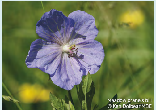
Meadow crane's bill