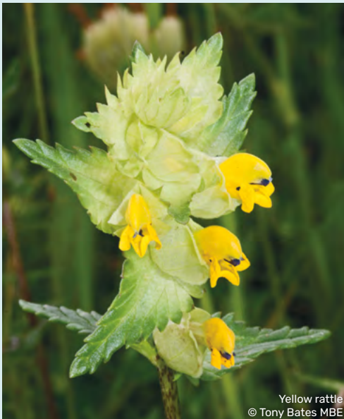
Yellow rattle