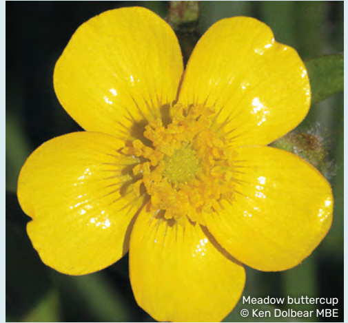
Meadow buttercup

Yellow rattle is a semi-parasite on grasses, reducing the vigour of grass and so favouring other flowers. It is an annual so does need to seed each year and is therefore best in a meadow mown in summer. Allow the seed to fall once ripe - by early July.