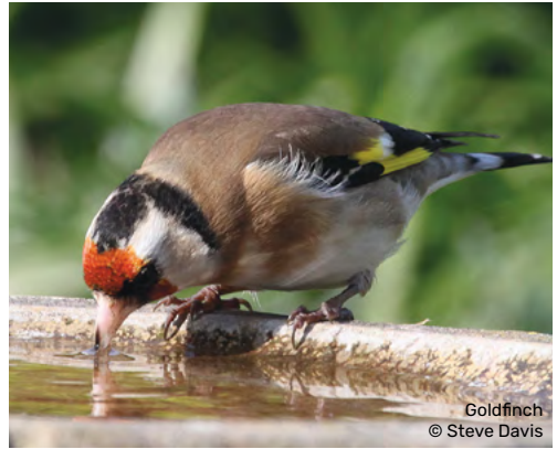
Goldfinch