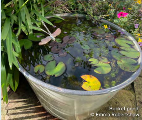
Bucket pond

Think you don't have enough space for plants? Think again! This leaflet offers tips on attracting wildlife to balconies, patios and window boxes. Most wildlife is remarkably mobile - provide the right conditions and it will find you.