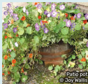
Patio pot