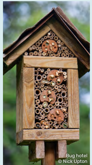
Bug hotel